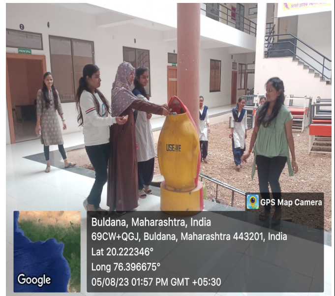
Use of Dustbin