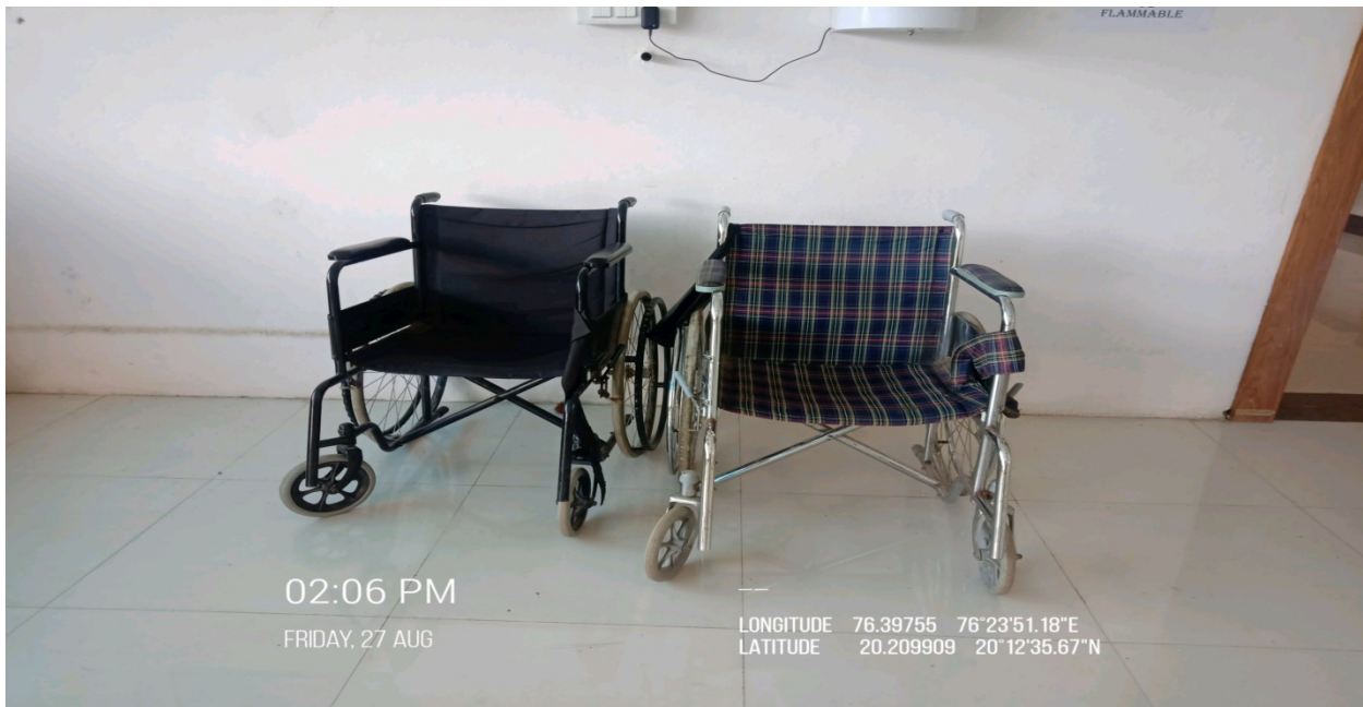
Wheel Chair for disable Students