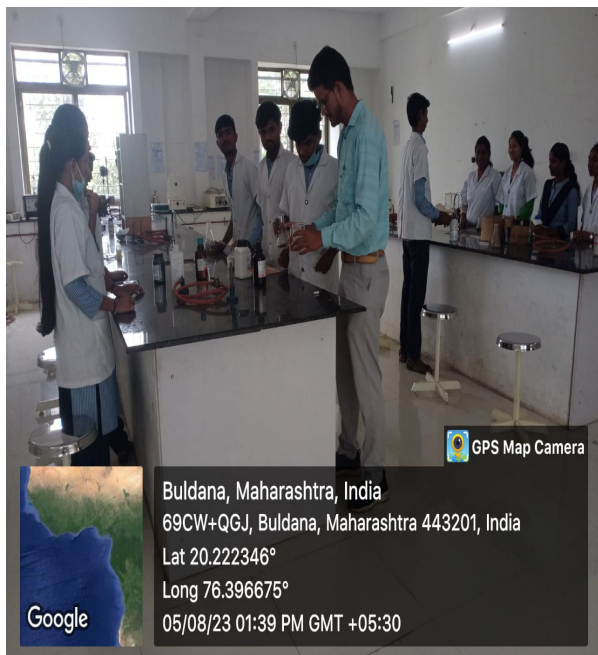
Chemicals used as required in the Lab.