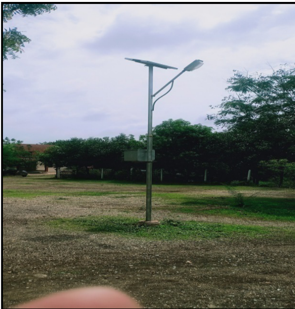
Solar Lamp in College Campus