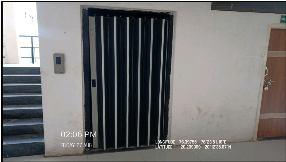
Lift Facility for Disable Students