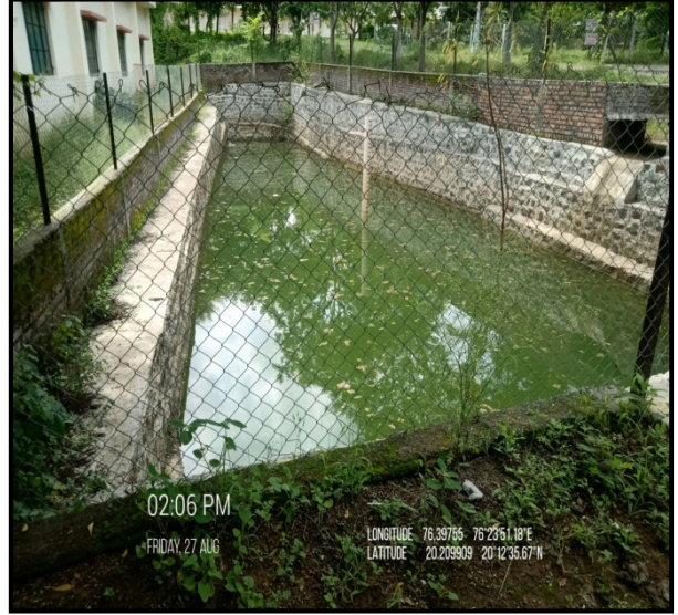
Structure for the rain water harvesting near library building