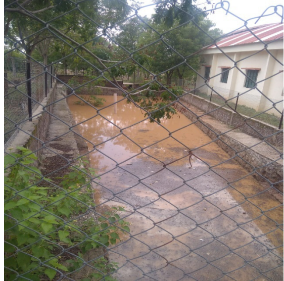
Borewell recharges with water conservation structure in campus