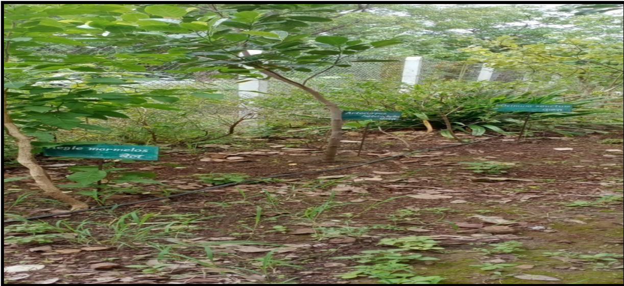
Drip irrigation system for garden