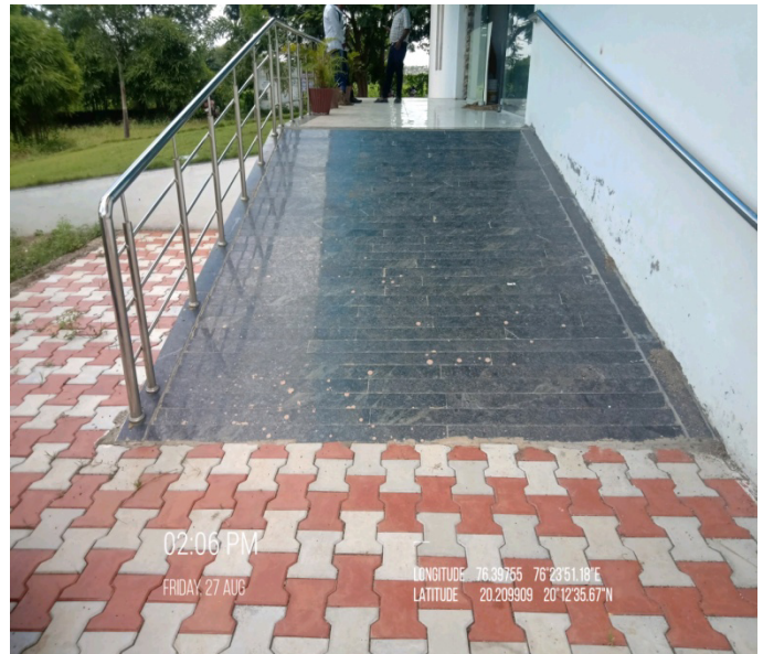
Ramp for Disable Students