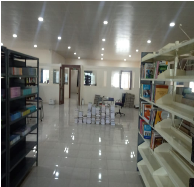
Use of LED Bulbs