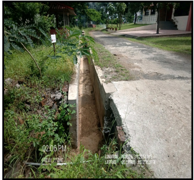
Tunnel collecting rain water for harvesting in College Campus