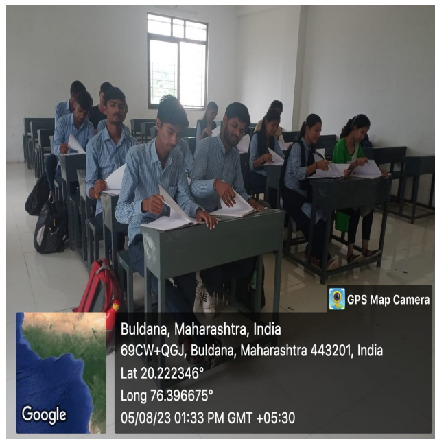
Student reused old notebook to avoid Waste