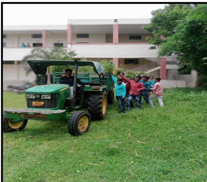
Tractor Carrying Organic Waste