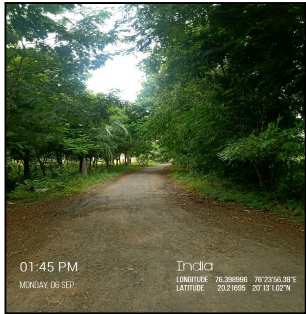
Pedestrian Friendly pathways