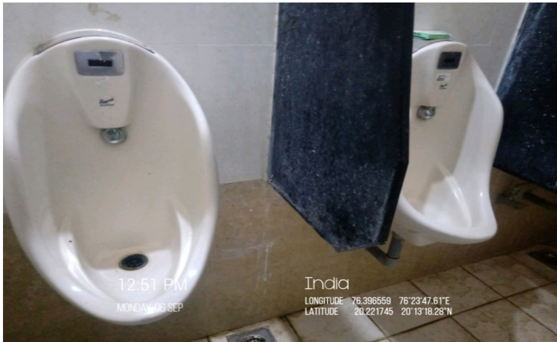
Sensor Based Urinal System