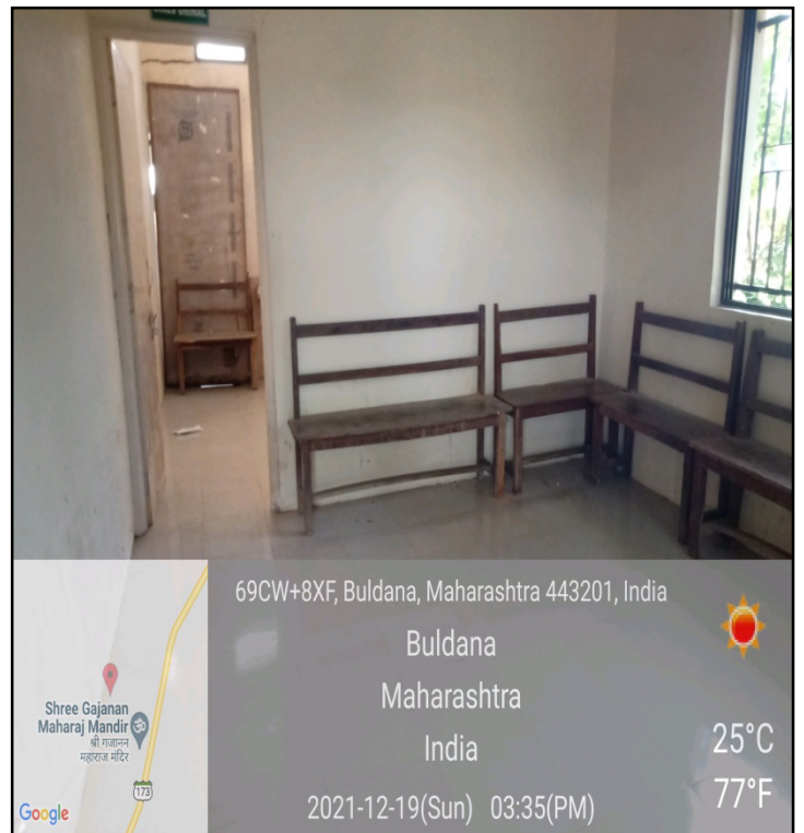
Girls Common Room