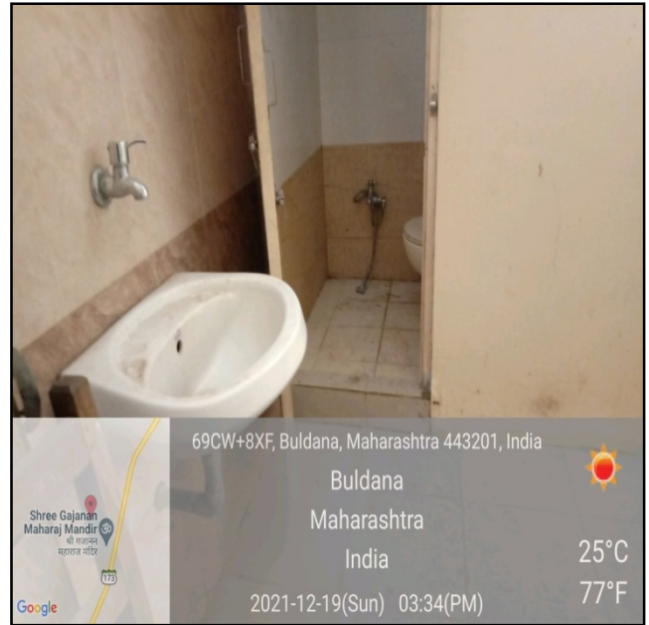
Wending Machine & Girls Toilet Facility for girl Students